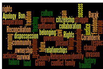
Minutes of Evidence Curriculum & TRP